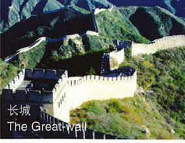
长城 The Great Wall