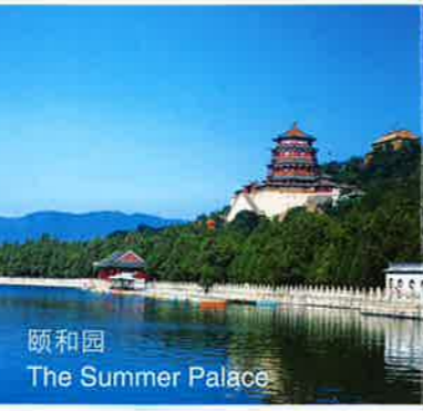
颐和园 The Summer Palace