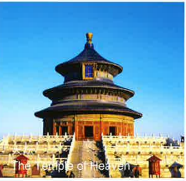
天坛 The Temple of Heaven