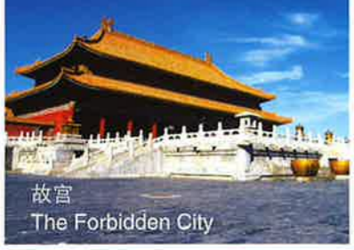
故宫 The Forbidden City